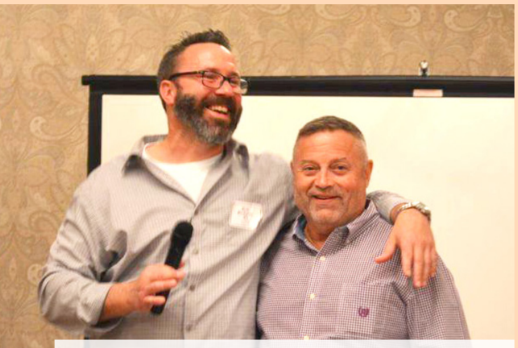
A full album of photos from the event can be viewed on the Mount Union Alumni Facebook page at facebook.com/mountunionalumni.